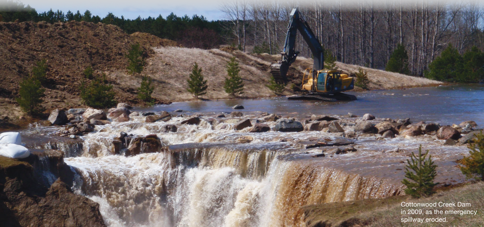
Cottonwood Creek Dam in 2009, as the emergency spillway eroded.