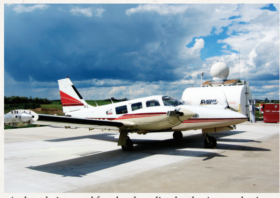
A plane being used for cloud seeding by the Atmospheric Resources Board.

ARB represented a logical addition to the Water Commission, with their efforts to increase knowledge of, and improving the effectiveness of cloud seeding science in order to increase rainfall and reduce hail damage.