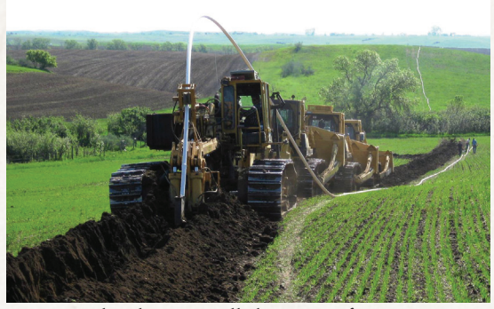
Water pipeline being installed, as part of SWPP.

During this period, there were two droughts; a minor one in the early eighties, and a fairly severe one from the late eighties into the early nineties. Both stressed agriculture, industry and even municipal supplies. An open question was whether the state was eventually going to dry up and blow away. Despite the droughts, the Water Commission was able to realize its mission of managing water for the benefit of its citizens through projects for municipal and industrial uses, such as SWPP. However, demographic changes in the state, from rural to urban, and west to east, were continuing, presenting a serious challenge to getting the state's water to where it was most needed.