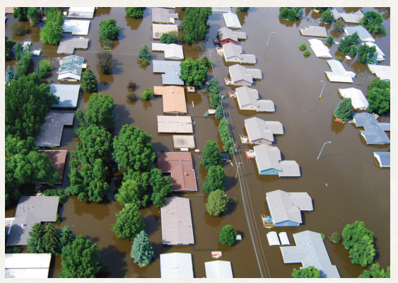
The 2011 flood of the Mouse River inundated large portions of the city of Minot.

Damages from the Red and Missouri Rivers were estimated at $50 million from the 2011 flood.