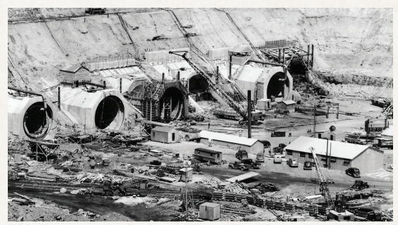
Garrison Dam, in 1951, prior to completion.

The Flood Control Act of 1944 provided for the construction of six dams on the mainstem Missouri River, which already had a centurylong history of flooding people in lower basin states. The dams were built primarily for flood control, navigation, irrigation and hydropower. While the 1937 Plan examined the possibility of a dam on the Missouri River, it rejected the idea, stating "The lake [Sakakawea] would cover thousands of acres of the best bottom lands on both sides of the Missouri River for half its length in North Dakota." and, "The chief objection to the building of such a large dam is the uncertain foundation conditions which are clay, shale, and soft sandstone. The dam could be built presumably safe, but, if it should ever fail, the sudden release of so enormous a body of water would be such a stupendous disaster that it is not permissible to run such a risk." It should be noted, that changes in the proposed location of and design improvements of the dam later overcame those obstacles to construction.