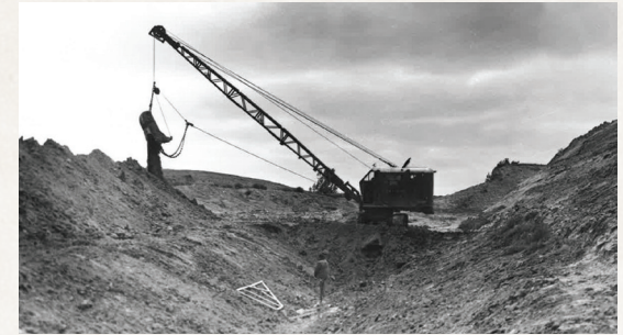
A drag-line excavating the main canal for the Buford-Trenton irrigation district in Williams County, ND.

county's edge; drainage, irrigation, and flood control were areas that needed a basin-wide strategy.