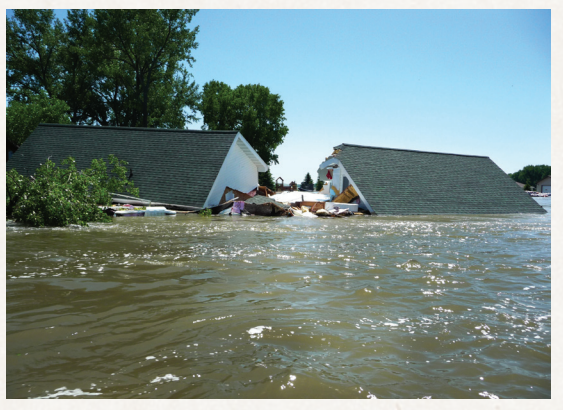
A house collapses into the Missouri River due to bank erosion during the record 2011 flood.

2011 was a year of flooding in the Red River Valley, but it was also record breaking in the Missouri River and Souris River basins. A combination of extremely full reservoirs, significant snowpack, and record breaking rainfall in May and June put the region in a crisis. The cities of Bismarck and Mandan saw significant flooding, but avoided the worst-case scenario. In Minot however, the flooding was catastrophic.