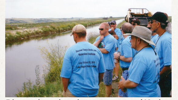
Educators learn about the water resources of North Dakota in 2011.

In the 1980s, the re-formulation of Garrison Diversion led to the Garrison Diversion Project's Municipal Rural and Industrial Water Supply Program. This program provided up to 75% of the cost for development of water supply projects. Making water supply projects eligible to access these funds made it possible to satisfy a chronic water supply problem in southwestern North Dakota. In 1983, the State Legislature authorized the Water Commission to construct and operate the Southwest Pipeline Project (SWPP) to provide water to southwestern North Dakota. Construction of the SWPP began on the main transmission lines in Mercer County in 1986, and today serves most of the region south west of the Missouri River in North Dakota.