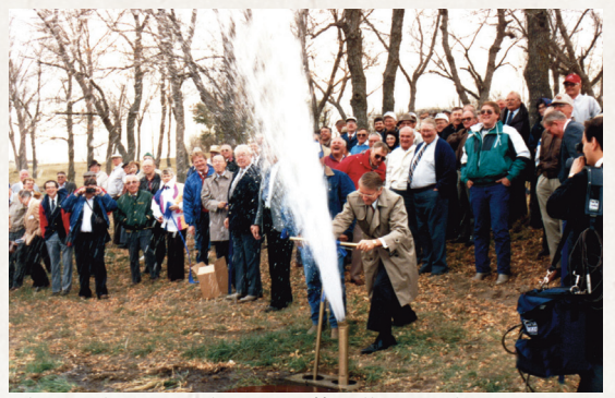
The Southwest Pipeline was officially turned on in 1991.

was decreasing, the rise of the environmental movement and laws that required that projects analyze and mitigate their impacts presented new obstacles to building projects of almost any size.