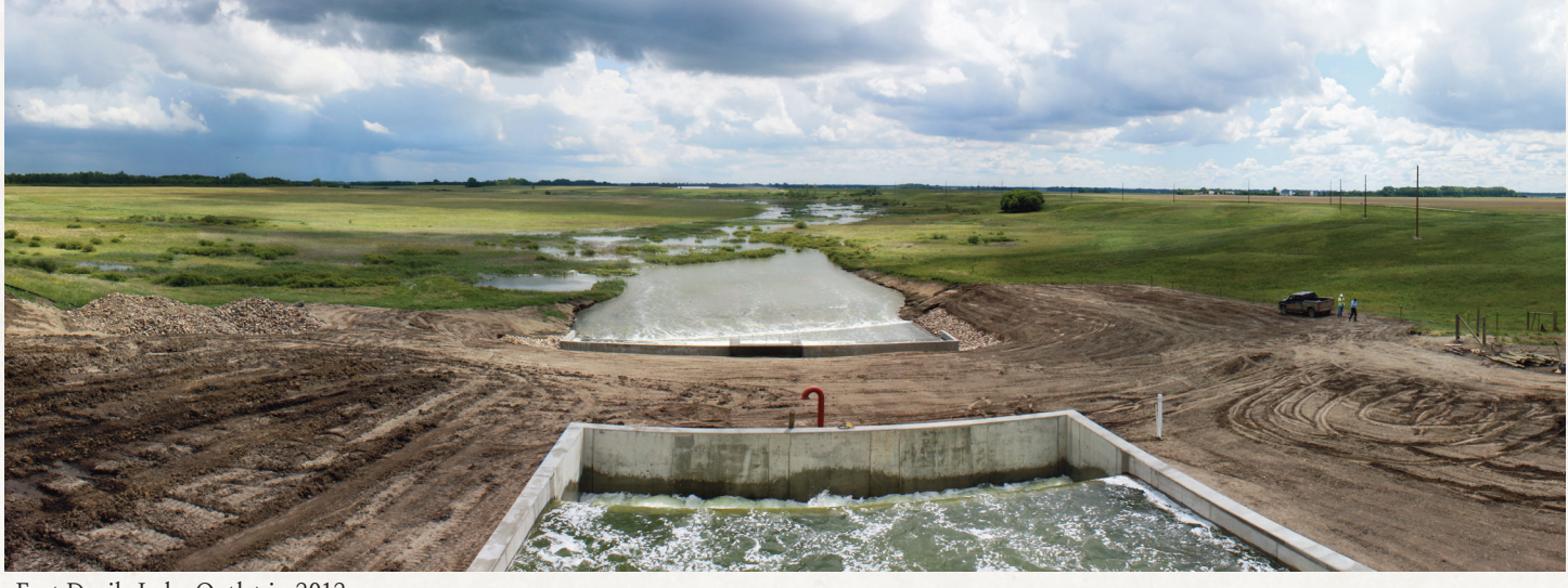
East Devils Lake Outlet in 2012.

data storage in the late 1990s and early 2000s. which made it feasible to have most of the Water Commission's paper records digitized and made available to the public for free on-line. Further accessibility of the immense amounts of collected data, approximately 50 terabytes (50 trillion bytes), via the Water Commission's MapService and website, which has everything from survey plats, to pictures of dams, to well driller logs, and more, is a valuable tool, now available to the public for free. Having in-house information technology professionals, who also have science backgrounds, allowed the Water Commission to customize its systems to meet the needs of the agency and the public. Chris Bader, Information Technology Manager for the Water Commission describes it as "Having the data collection driving the evolving technologies, not the other way around."