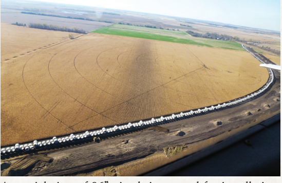
An aerial view of 96" pipe being staged for installation along the route of the East Devils Lake Outlet in 2011.

By 2008, it seemed as if perhaps the wet cycle, which had caused so many headaches in the state, was easing somewhat. Unfortunately, things were just going to get more complicated.