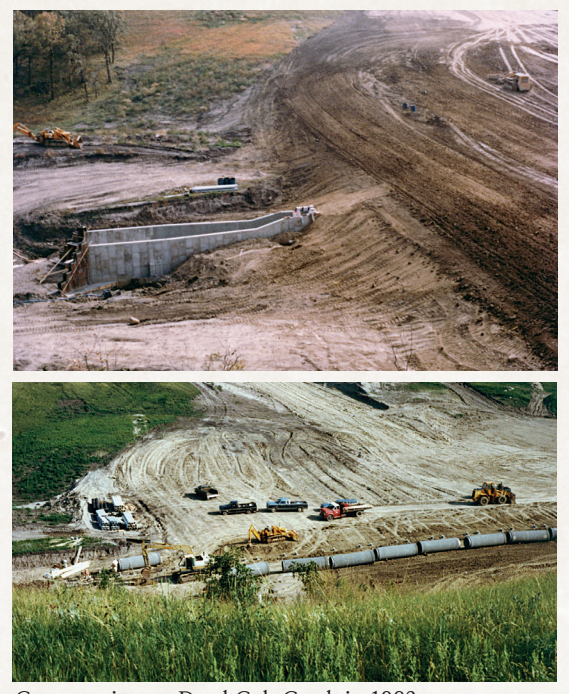
Construction on Dead Colt Creek in 1983.

Abraham Lincoln said, "The philosophy of the schoolroom in one generation will be the philosophy of the government in the next."