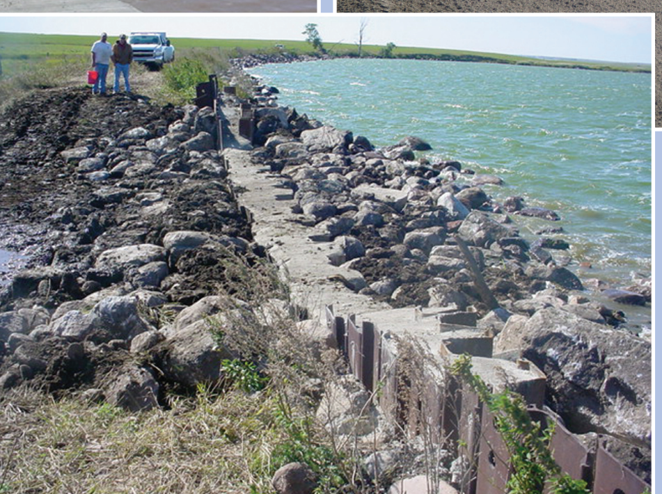
At the Green Lake project, concrete was poured between two sections of sheet pile and rock protection was installed on both the upstream and downstream sides of the structure.