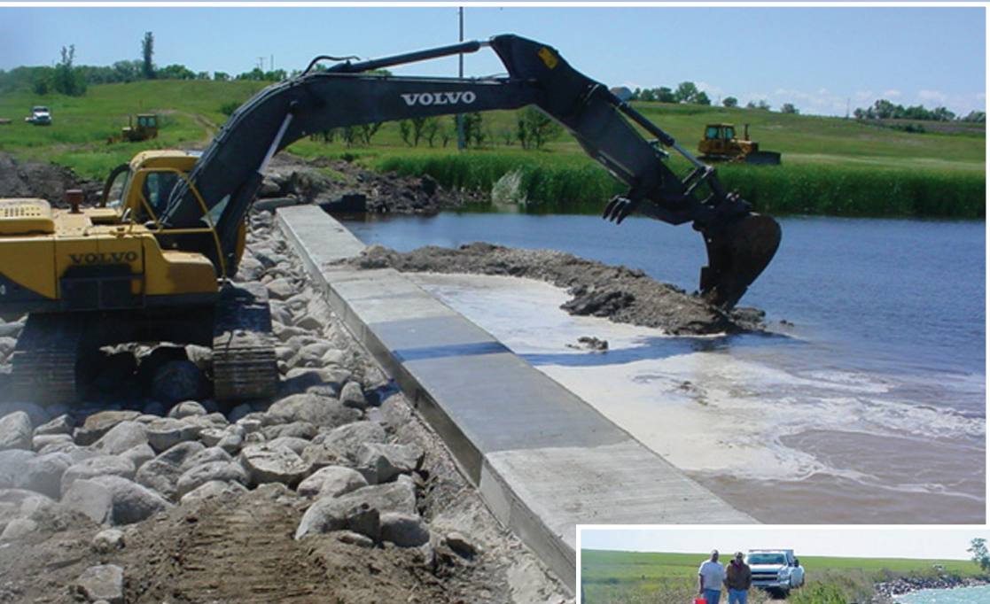
The new concrete cap and rock riprap fish passage at Sheyenne Dam.