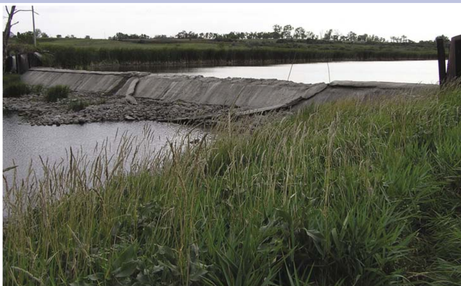
The Sheyenne Dam, in Eddy County.

The official meeting minutes can be downloaded from the Water Commission's website at www.swc.nd.gov , then click on "About the SWC."