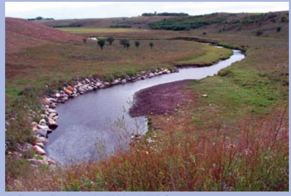
The Sheyenne River just south of Wellsburg in Wells County.

You can find the EMP and other related documents on the Water Commission website at www.state.nd.us by clicking on "Devils Lake Flooding" and then "Outlet." Paper copies of the EMP can be obtained by contacting the Planning and Education Division of the Water Commission at 701-328-4989 or by e-mailing dschock@state.nd.us.