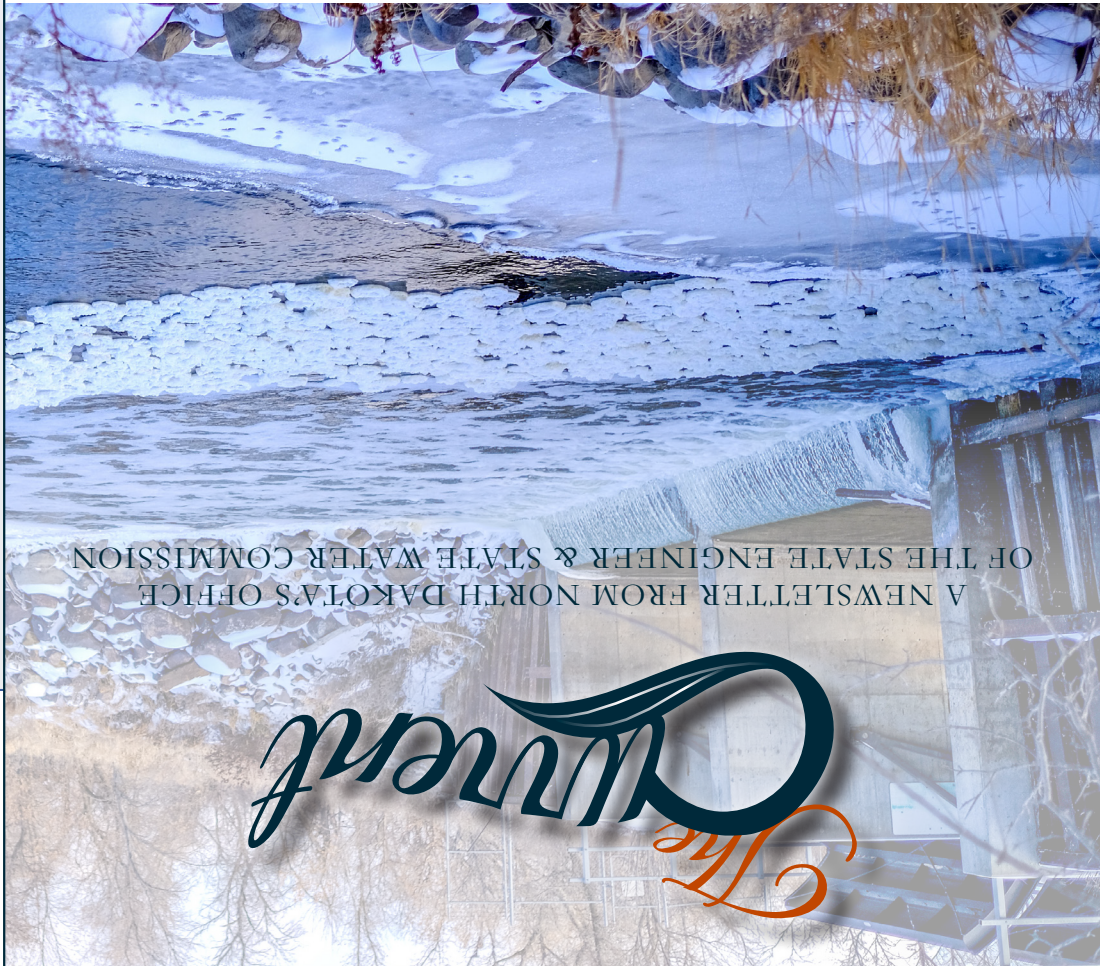
Ice formation at Eaton Dam located in McHenry County.

A NEWSLETTER FROM NORTH DAKOTA'S OFFICE OF THE STATE ENGINEER & STATE WATER COMMISSION