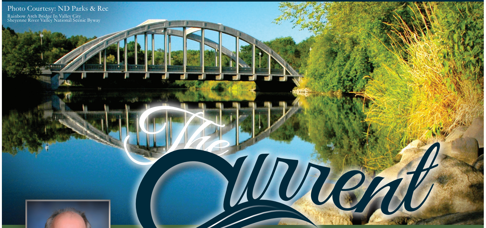
Rainbow Arch Bridge In Valley City Shyenne River Valley National Scenic Byway