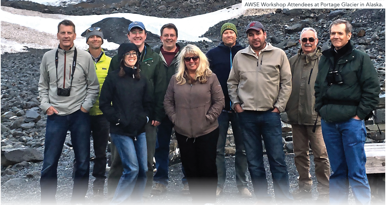
AWSE Workshop Attendees at Portage Glacier in Alaska.