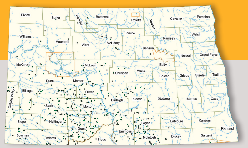
Green dots represent locations of completed Program projects.

Upon activation in 2017, the program provided cost-share to fund 50% of project costs up to $3,500 per project. But during the 2019 Legislative Session, that amount was increased to $4,500. Examples of completed projects include new wells, rural water system connections, pipeline extensions, pasture taps and associated works, labor, materials, and equipment rentals for work completed by the producer.