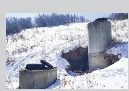
A sink hole discovered on April 10, 2018.

are 11 miles west of Washburn. The dam is two earth embankments built in 1971 as part of improvements