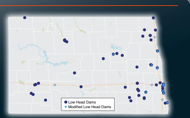
Known low head dams in North Dakota, and those that have had rock ramps installed.

Sheyenne Dam, in Eddy County, had a rock ramp installed in 2008, in a cooperative effort with eight cost-share partners, including the Water Commission and the Game and Fish Department. The structure no longer is affected by the roller affect, and fish are able to move upstream.