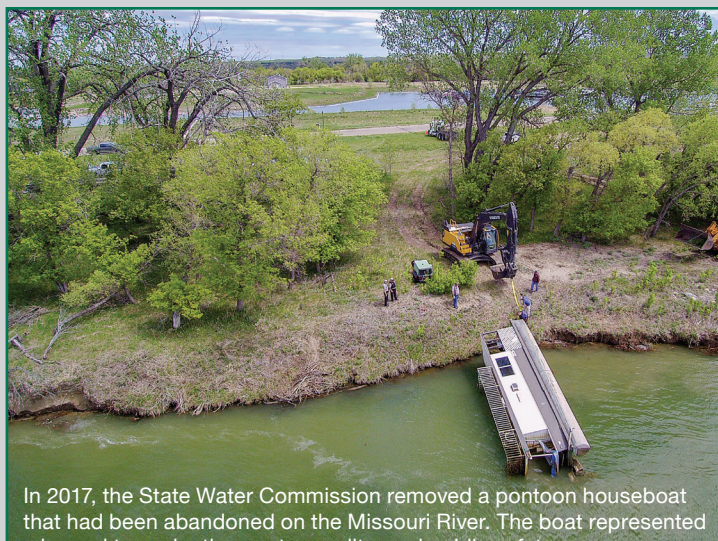
a hazard to navigation, water quality, and public safety.

The State Engineer manages, operates, and supervises North Dakota's sovereign lands, for multiple uses that are consistent with the Public Trust Doctrine (PTD). The State Engineer is charged with managing North Dakota's sovereign lands in the best interest of present and future generations. Meeting these goals can be challenging, given the increasing popularity of water-based recreation, the draw of waterfront property for development, and the needs of transportation and industry.