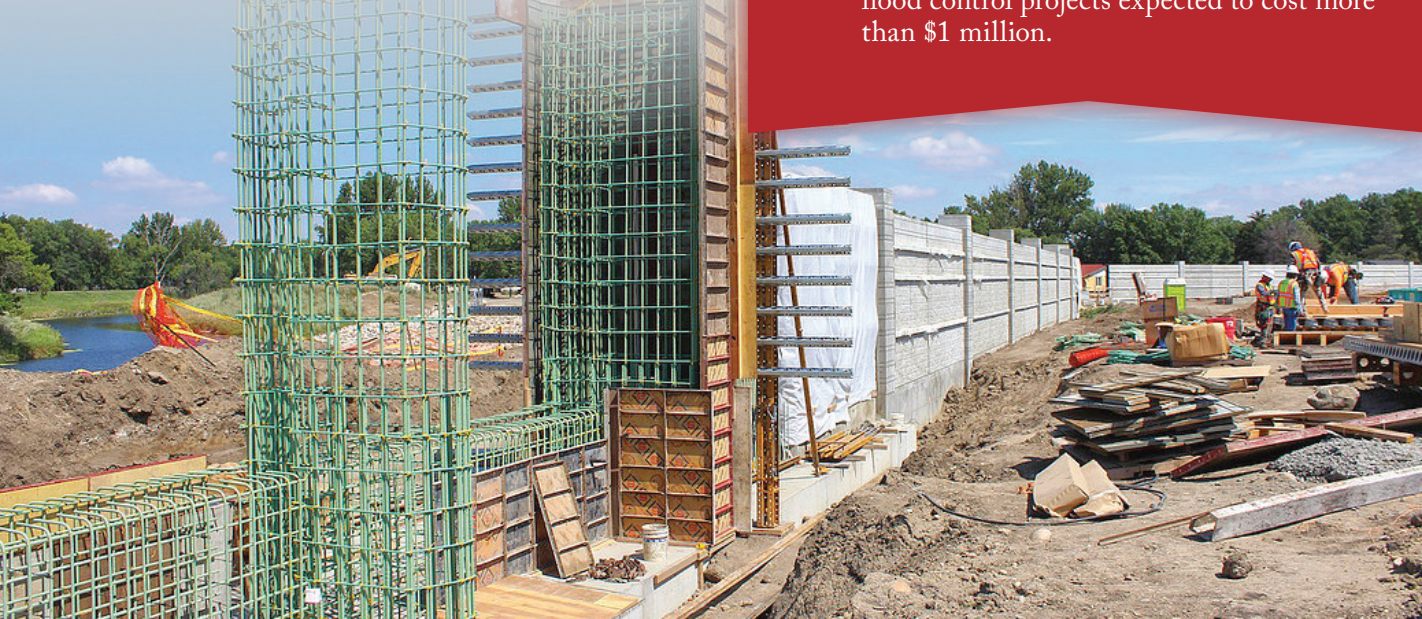
Mouse River flood control under construction.