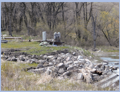
The intake in the Forest River for the ARR.