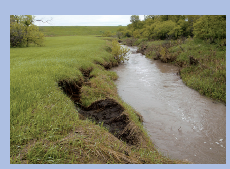
Erosional slumping on the emergency spillway at Herzog Dam.

Herzog Dam experienced flow through the emergency spillway in late May. The principal spillway outlet received some erosional damage that will require repair, but the work is not currently critical. The emergency spillway will need minor maintenance at some point as well. Fortunately, there was no major damage to the emergency spillway.