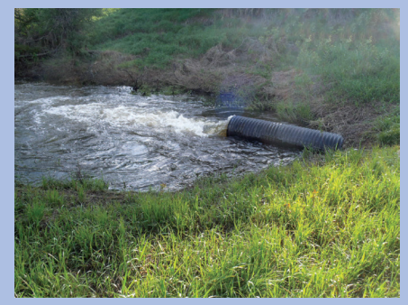
High flows through Morrison Dam.

Morrison Dam had water flow through its emergency spillway twice this spring - once from snowmelt, and then later due to significant late May rainfall. Only minor damage to the emergency spillway resulted.