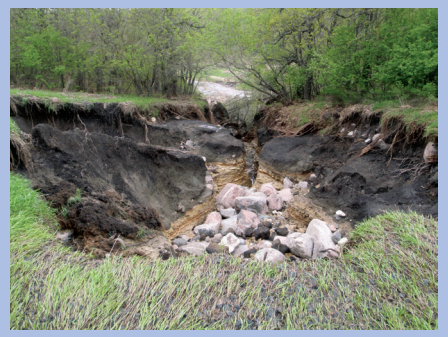
Major erosion to the emergency spillway at Bourbanis Dam.

Bourbanis Dam was affected by flooding this spring, with water flowing multiple times through the emergency spillway in late May. Flooding resulted in major erosion to the spillway, with a trench 200' long, 75' wide, and 20' deep. At the entrance to the emergency spillway, further erosion resulted in a channel 380' long, 50' wide, and 2' deep. This damage will require repair in the very near future.