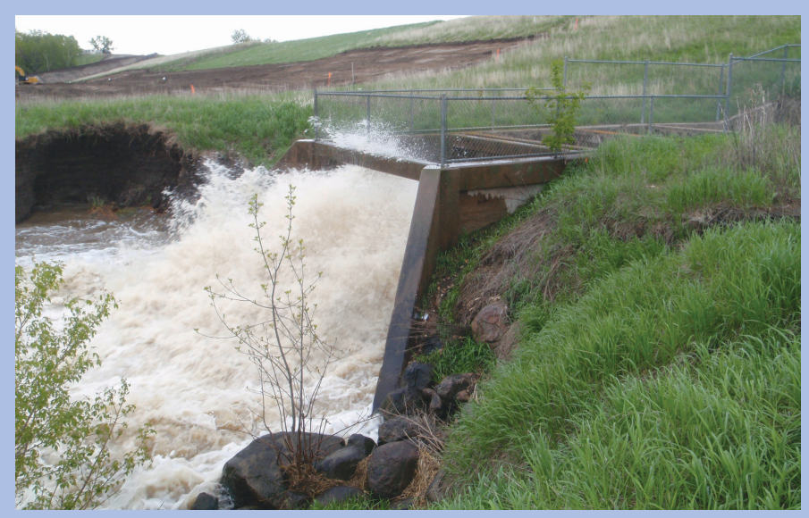
High flows through Renwick Dam.

While crisis was averted in 2013, a number of structures now need repairs or improvements. In the past, the Water Commission has provided financial assistance for dam repairs throughout the state. With the aging of this infrastructure and the ongoing wet cycle, it is likely that the Water Commission will continue its support of improvements to these critical structures in the future.