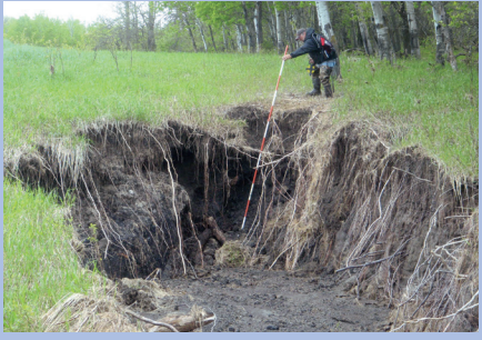
Back cutting on the downstream side of the emergency spillway at Olson Dam.

The north emergency spillway was also damaged and needs repairs, after flows resulted in a head cut on the downstream side, creating a large hole.