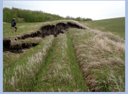
The ground slid on the emergency spillway due to spring flooding at Olson Dam.

in a 120' section of the spillway dike being significantly impacted. This damage is quite serious, which would be exacerbated by further flows, so repair is critical.