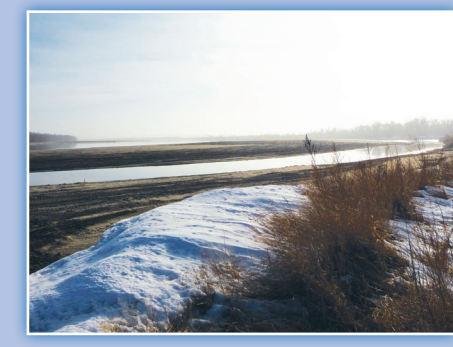
Excavated channel looking south to the confluence of the Missouri and Heart Rivers. 11,000 cubic yards of material were removed to create the channel.

Dredging work on sandbars on the Missouri River in south Bismarck and Mandan started on November 19. Preliminary work started the week prior, with construction crews building access to the sandbar located near Fox Island. Work on both sides of the river was completed by November 30.