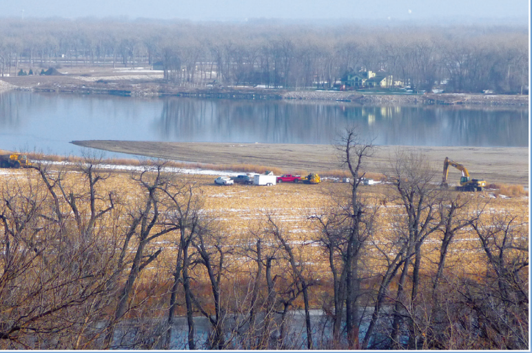
Excavation equipment staged near the Missouri and Heart River confluence as seen from Fort Abraham Lincoln State Park.

Additionally, a new United States Geological Survey (USGS) gage has been installed south of Fort Abraham Lincoln. This gage station was funded by the State Water Commission, and is operated by the USGS. The addition of the new gage south of Mandan will provide data about river levels that can be compared to, and evaluated with data from the gage in Bismarck. This data can be used to indicate the formation of ice jams, to enhance situational awareness and emergency management of the Missouri River.