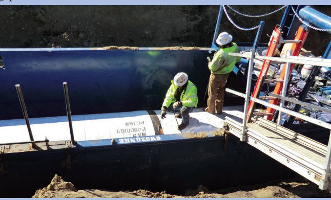
Workers install pipe for the east outlet in 2011.

floodwater from the lake. The East Devils Lake Outlet is expected to be operational in the spring of 2012.