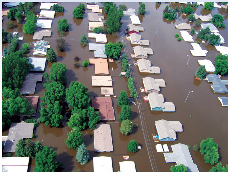
Inundated homes in Minot in 2011.

Record shattering flooding in 2011 caused damage throughout North Dakota, but the impacts were especially severe in the cities of Minot and Burlington, and Ward County. At their Feb. 2 teleconference meeting, the Water Commission approved requests from Minot, Burlington, and Ward County for financial assistance in the acquisition of property for future flood control projects. Funding for these projects was appropriated to the SWC in Senate Bill 2371 during the Special Legislative Assembly that was held last fall.