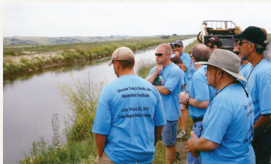
Educators learn about the water resources of North Dakota in 2011.

In the 1980s, the re-formulation of Garrison Diversion led to the Garrison Diversion Project's Municipal Rural and Industrial Water Supply Program. This program provided up to 75% of the cost for development of water supply projects. Making water supply projects eligible to access these funds made it possible to satisfy a chronic water supply problem in southwestern North Dakota. In 1983, the State Legislature authorized the Water Commission to construct and operate the Southwest Pipeline Project (SWPP) to provide water to southwestern North Dakota. Construction of the SWPP began on the main transmission lines in Mercer County in 1986, and today serves most of the region south west of the Missouri River in North Dakota.