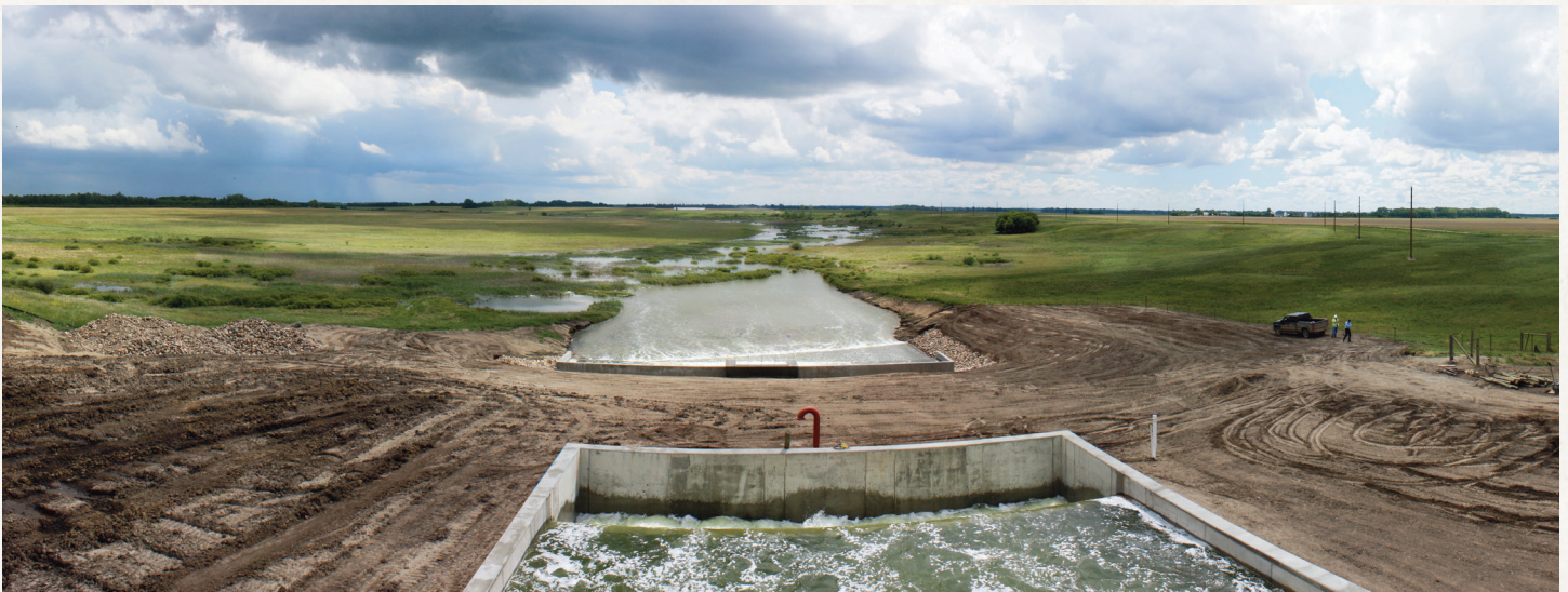
East Devils Lake Outlet in 2012.