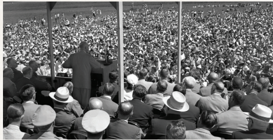
President Dwight Eisenhower at the Garrison Dam closure ceremony, June 11, 1953.

the basis for granting water permits. Previously, the state had used a mix of prior appropriation; where first beneficial permitted use has priority, and the riparian doctrine, where the landowner adjacent to water, had certain rights to that water.