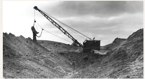
A drag-line excavating the main canal for the Buford-Trenton irrigation district in Williams County, ND.

county's edge; drainage, irrigation, and flood control were areas that needed a basin-wide strategy.