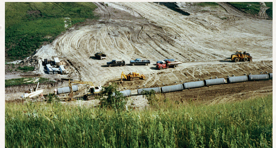
Construction on Dead Colt Creek in 1983.

During this period, there were two droughts; a minor one in the early eighties, and a fairly severe one from the late eighties into the early nineties. Both stressed agriculture, industry and even municipal supplies. An open question was whether the state was eventually going to dry up and blow away. Despite the droughts, the Water Commission was able to realize its mission of managing water for the benefit of its citizens through projects for municipal and industrial uses, such as SWPP. However, demographic changes in the state, from rural to urban, and west to east, were continuing, presenting a serious challenge to getting the state's water to where it was most needed.