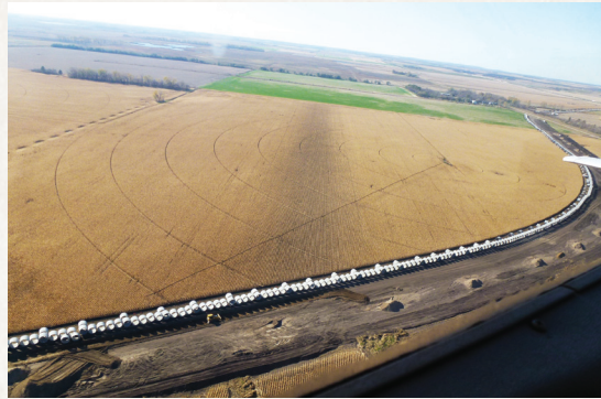
An aerial view of 96" pipe being staged for installation along the route of the East Devils Lake Outlet in 2011.

By 2008, it seemed as if perhaps the wet cycle, which had caused so many headaches in the state, was easing somewhat. Unfortunately, things were just going to get more complicated.