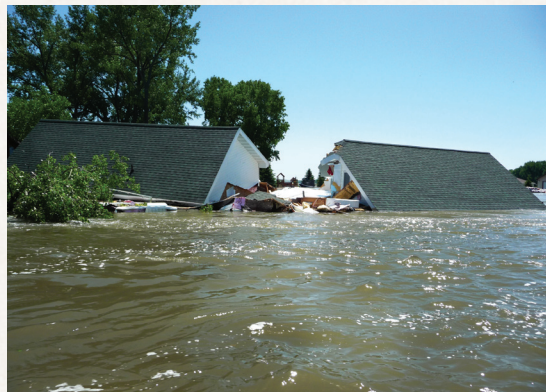
A house collapses into the Missouri River due to bank erosion during the record 2011 flood.

2011 was a year of flooding in the Red River Valley, but it was also record breaking in the Missouri River and Souris River basins. A combination of extremely full reservoirs, significant snowpack, and record breaking rainfall in May and June put the region in a crisis. The cities of Bismarck and Mandan saw significant flooding, but avoided the worst-case scenario. In Minot however, the flooding was catastrophic.