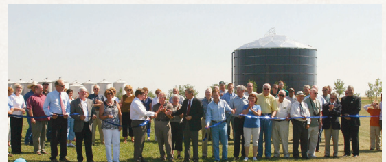
Ribbon cutting ceremony to celebrate NAWS providing water service to Fort Berthold in 2008.

In the mid-2000s, a combination of high oil prices and emerging technologies such as hydraulic fracturing, made possible the recovery of oil from petroleum-bearing shale in western North Dakota. While groundwater can be used for hydraulic fracturing, limited availability and quality in the locations in North Dakota with oil-bearing rock meant the Missouri River and Lake Sakakawea represented the best