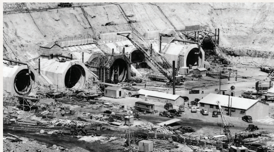
Garrison Dam, in 1951, prior to completion.

The Flood Control Act of 1944 provided for the construction of six dams on the mainstem Missouri River, which already had a century-long history of flooding people in lower basin states. The dams were built primarily for flood control, navigation, irrigation and hydropower. While the 1937 Plan examined the possibility of a dam on the Missouri River, it rejected the idea, stating “The lake [Sakakawea] would cover thousands of acres of the best bottom lands on both sides of the Missouri River for half its length in North Dakota.” and, “The chief objection to the building of such a large dam is the uncertain foundation conditions which are clay, shale, and soft sandstone. The dam could be built presumably safe, but, if it should ever fail, the sudden release of so enormous a body of water would be such a stupendous disaster that it is not permissible to run such a risk.” It should be noted, that changes in the proposed location of and design improvements of the dam later overcame those obstacles to construction.