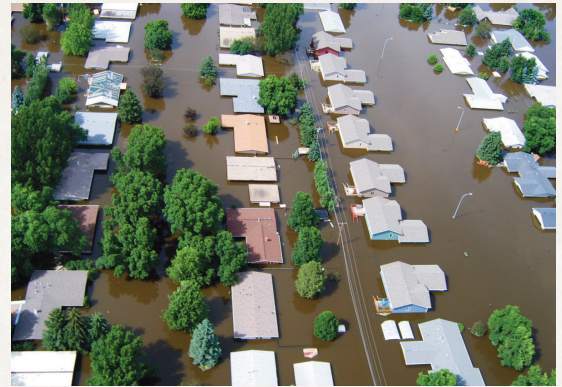
The 2011 flood of the Mouse River inundated large portions of the city of Minot.

Damages from the Red and Missouri Rivers were estimated at $50 million from the 2011 flood.