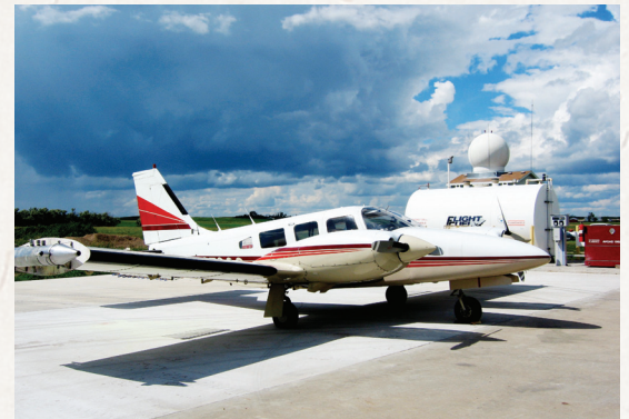
A plane being used for cloud seeding by the Atmospheric Resources Board.

ARB represented a logical addition to the Water Commission, with their efforts to increase knowledge of, and improving the effectiveness of cloud seeding science in order to increase rainfall and reduce hail damage.