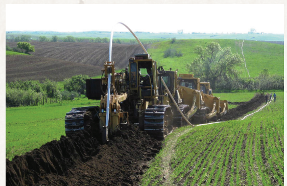
Water pipeline being installed, as part of SWPP.

During this period, there were two droughts; a minor one in the early eighties, and a fairly severe one from the late eighties into the early nineties. Both stressed agriculture, industry and even municipal supplies. An open question was whether the state was eventually going to dry up and blow away. Despite the droughts, the Water Commission was able to realize its mission of managing water for the benefit of its citizens through projects for municipal and industrial uses, such as SWPP. However, demographic changes in the state, from rural to urban, and west to east, were continuing, presenting a serious challenge to getting the state's water to where it was most needed.