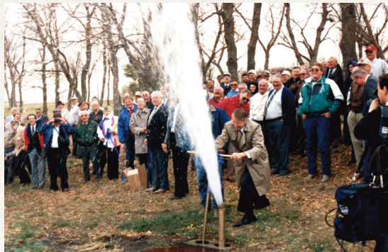
The Southwest Pipeline was officially turned on in 1991.

was decreasing, the rise of the environmental movement and laws that required that projects analyze and mitigate their impacts presented new obstacles to building projects of almost any size.