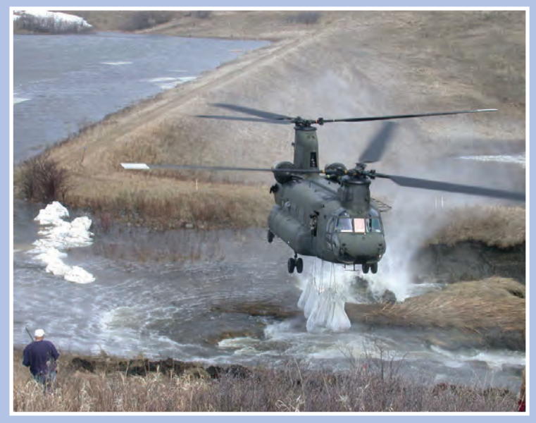
A National Guard helicopter dropped half-ton sandbags to help reinforce the earthen spillway at Clausen Springs Dam (April 2009).

Concrete rip-rap was also placed to slow erosion of the earthen spillway (April 2009).