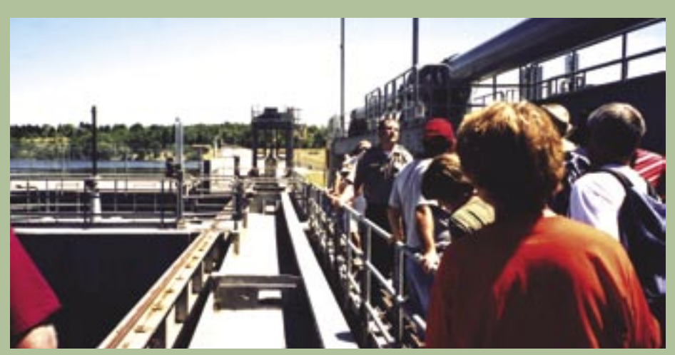
Learning about the management of Baldhill Dam from the U.S. Army Corps of Engineers, Valley City.