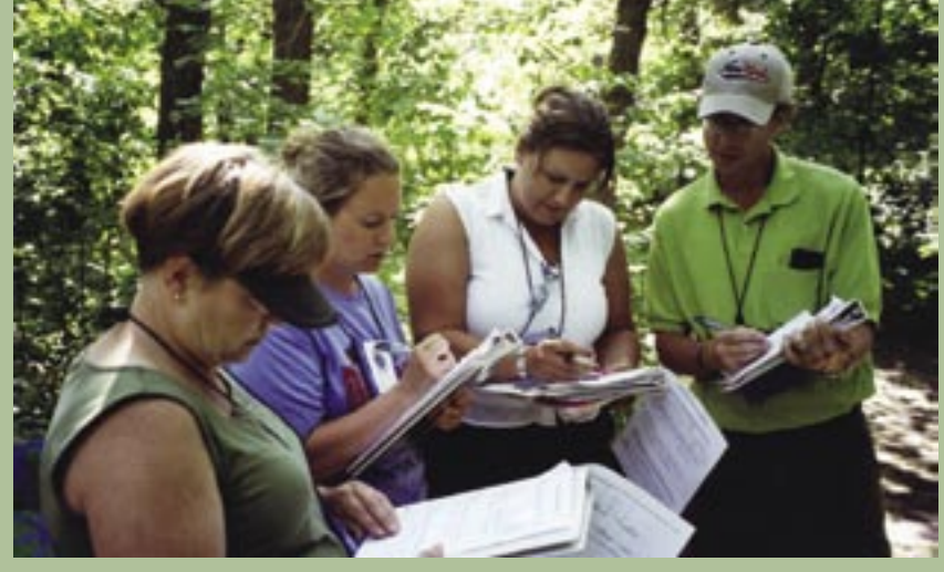
Participants completing their data analysis following measurements of stream flow and discharge on a stream near Valley City.