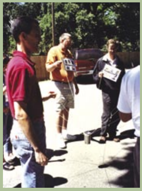
Institute participants learn about the complex task of managing different water users in a river through a Project WET activity.

For the first time ever, the James and Sheyenne rivers were made the focus of Project WET's summer institute. The 2006 Discover Today's James and Sheyenne Rivers institute was based out of Valley City State University, and was held July 9-13. Here is a look at some of the activities and participants that helped to make the 2006 institute a tremendous success.