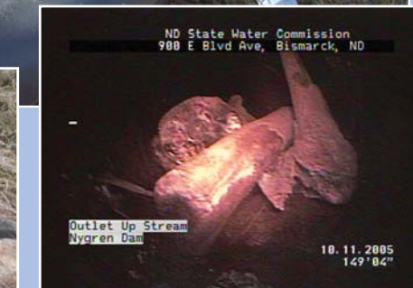
An obstruction is identified by the robotic crawler in the upstream outlet pipe at Nygren Dam.