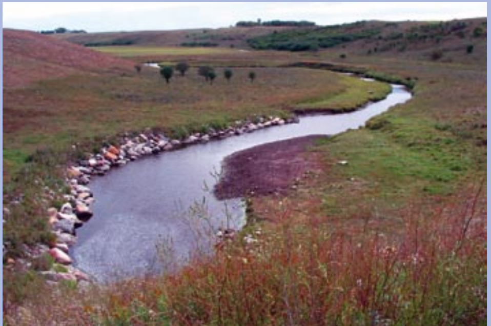
The Sheyenne River just south of Wellsburg in Wells County.

You can find the EMP and other related documents on the Water Commission website at www.state.nd.us by clicking on "Devils Lake Flooding" and then "Outlet." Paper copies of the EMP can be obtained by contacting the Planning and Education Division of the Water Commission at 701-328-4989 or by e-mailing dschock@state.nd.us .