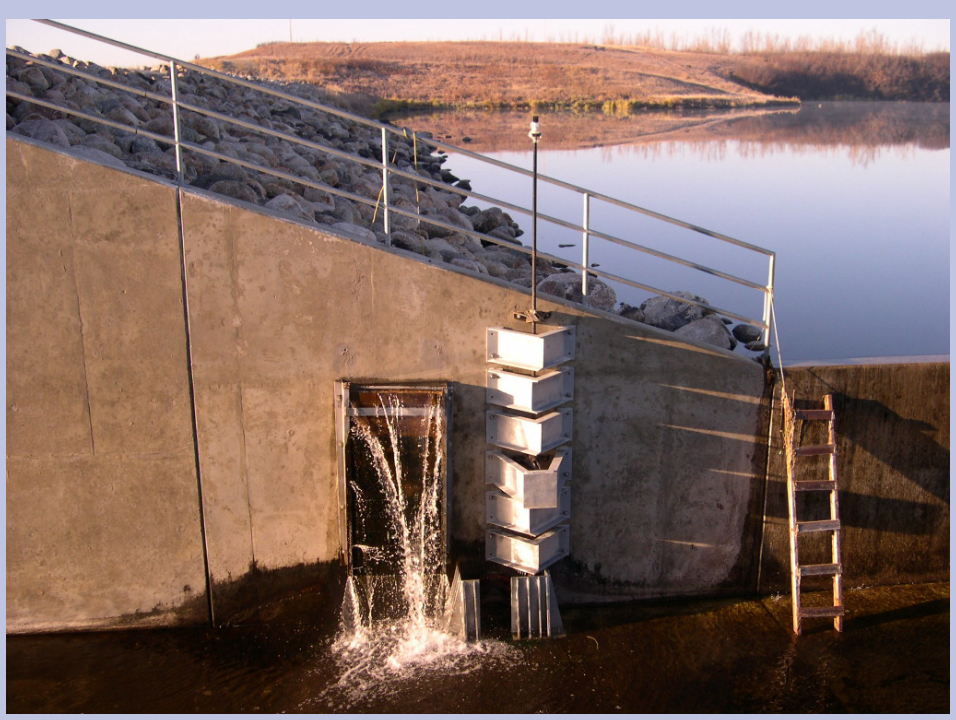
The stop-log structure that was installed in the Mount Carmel Dam spillway. Enough stoplogs can be removed to lower the reservoir up to 6 feet if necessary.