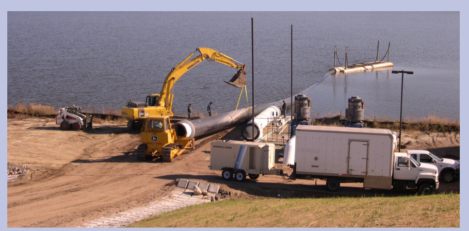
Removal of the Devils Lake Outlet Project intake pipe at the Round Lake pumping station.

The Water Commission's construction crew repaired several U.S. Geological Survey gaging stations throughout North Dakota. The work involved installation of orifice lines and staff gages, removal of gage houses, installation of gage houses, and repairs to sheet pile control sections.