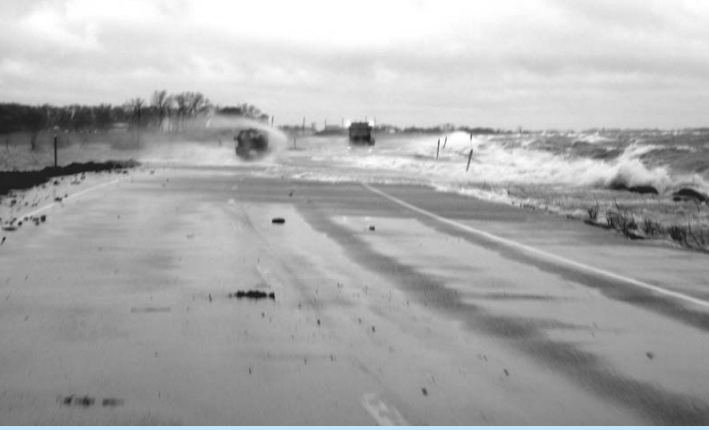
Travelers on Hwy. 281 met with 4-foot waves from Devils Lake in May.

In contrast, only 100 miles to the west, Lake Sakakawea was experiencing record low elevations, along with Lake Oahe to the south. By March 12, 2004, Lake Sakakawea had dipped to a record low of 1813.8 feet amsl, breaking the previous record of 1815 feet amsl, set in May 1991. By mid May 2004, the elevation of Lake Sakakawea was at 1814.3 feet amsl and falling—still almost a foot lower than the previous low set in 1991, and more than 20 feet below normal. It is also interesting to note that when