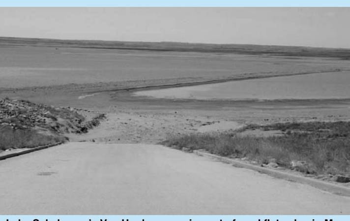
Lake Sakakawea's Van Hook ramps rise out of mud flats also in May.

Lake Sakakawea set its new record low in March 2004, it was about 41 feet lower than the level it hit in the spring of 1997.