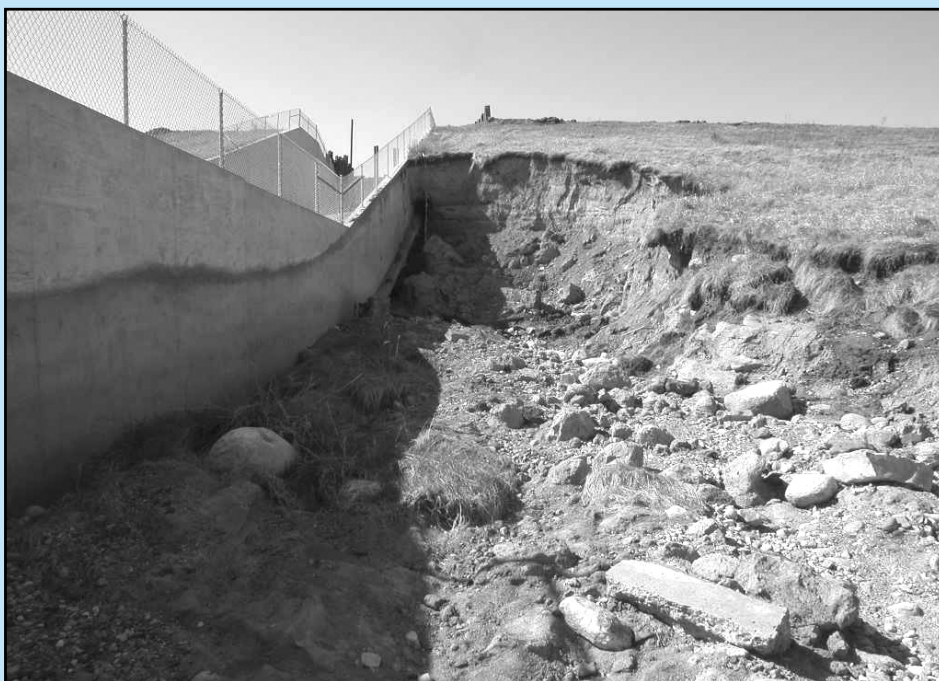
The downstream portion of the Mount Carmel Dam spillway that was washed out last spring. The new spillway will be constructed in the same location along the dam alignment.

Mount Carmel Dam is located in Cavalier County, approximately 14 miles northeast of Langdon.