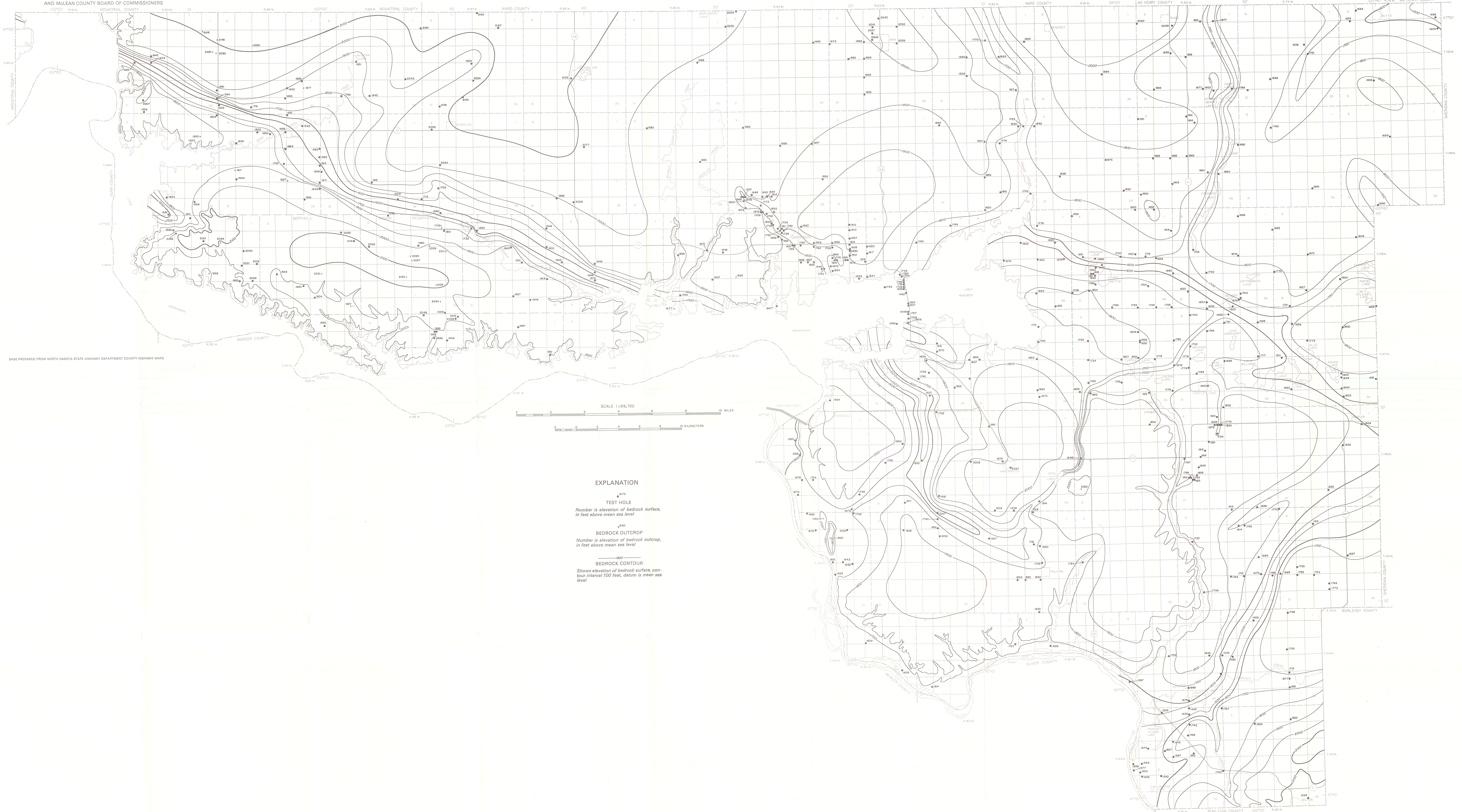
PLATE 1—MAP SHOWING BEDROCK (FORT UNION GROUP) TOPOGRAPHY IN McLEAN COUNTY, NORTH DAKOTA